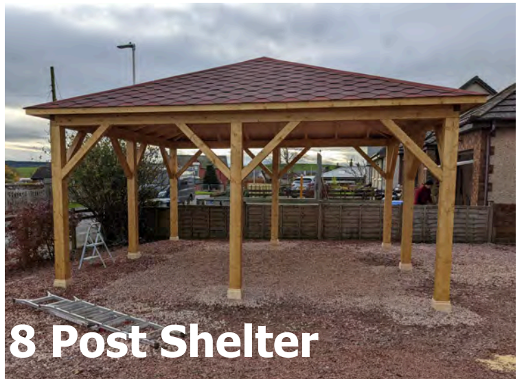
8 Post Shelter