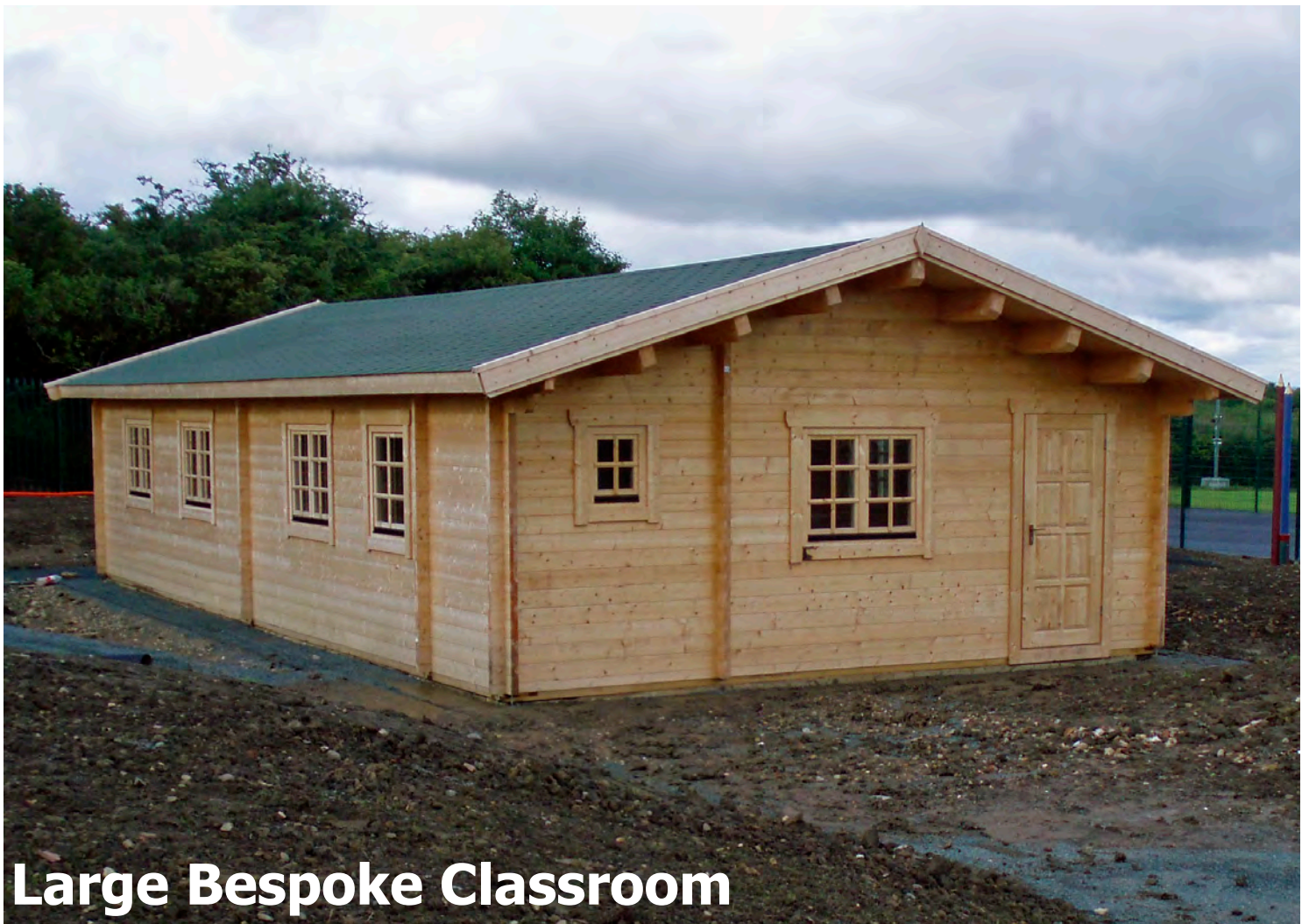
Large Bespoke Classroom