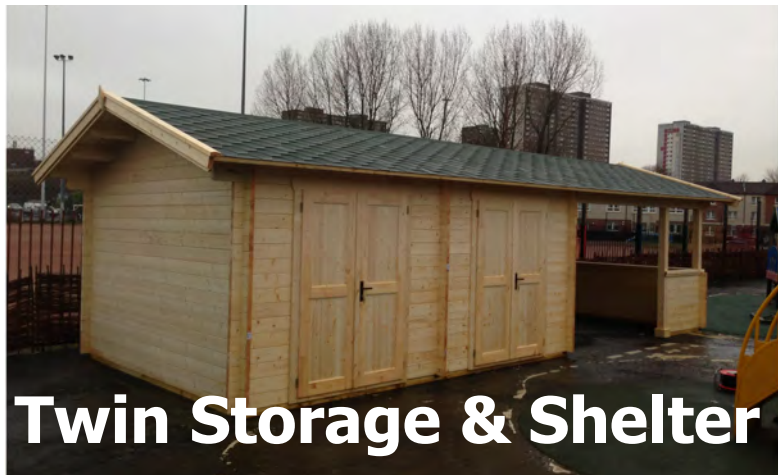
Twin Storage & Shelter