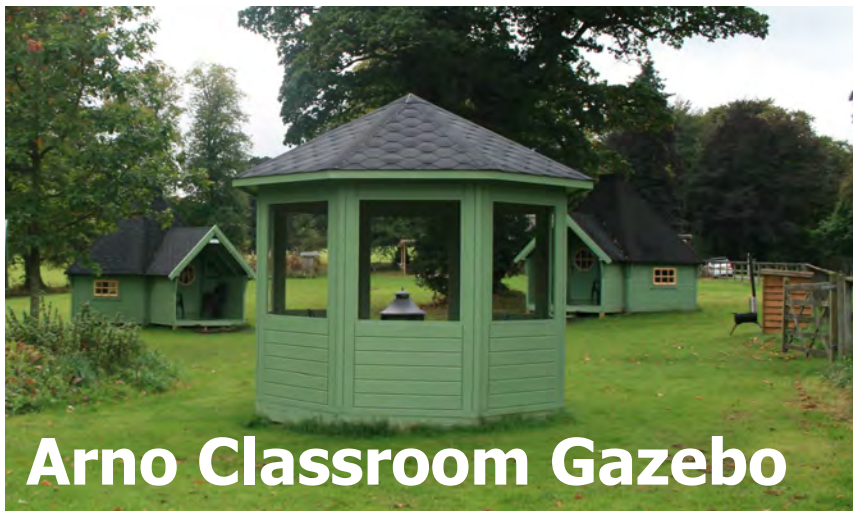
Arno Classroom Gazebo