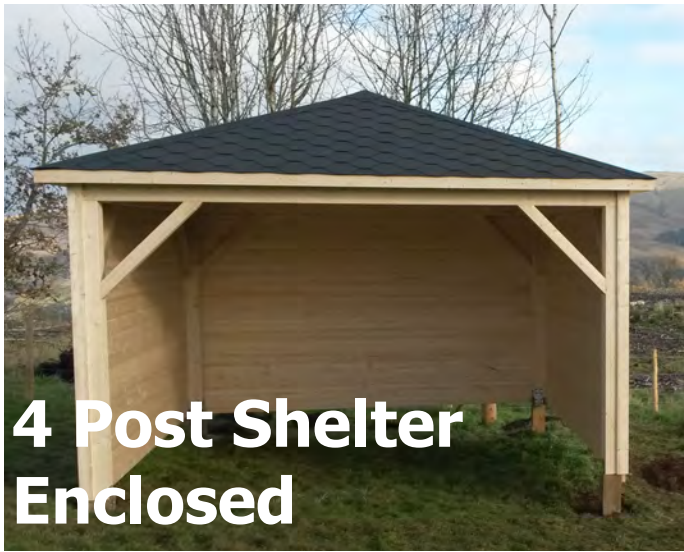
4 Post Shelter Enclosed