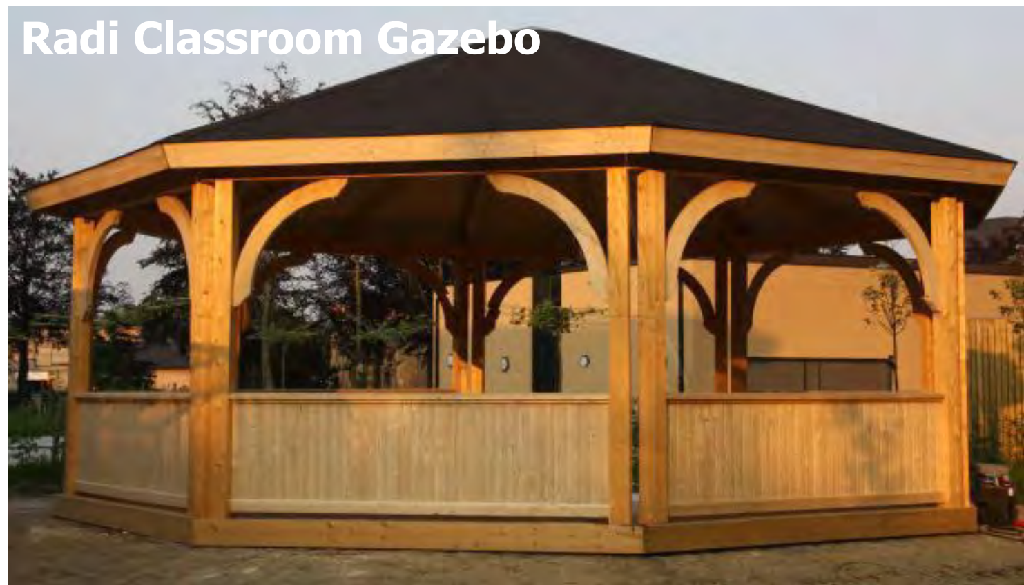
Radi Classroom Gazebo