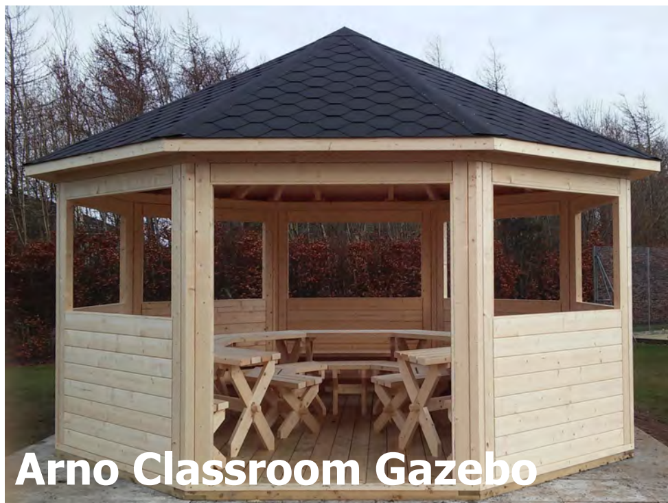
Arno Classroom Gazebo